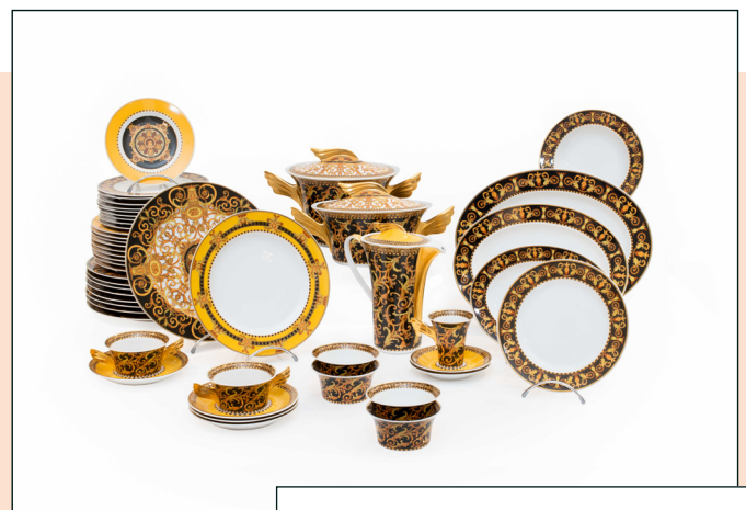
VERSACE SERVICE Model «Barocco» By Rosenthal, Germany Estimate: 400 - 600 €