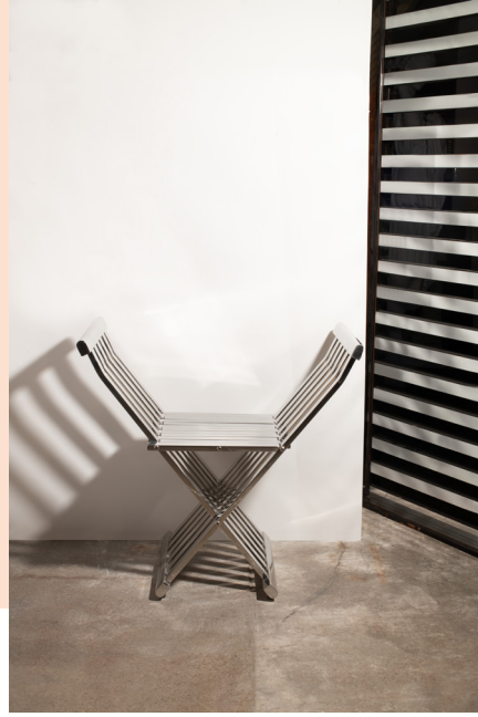
CURULE SEAT WITH ARMS In chromed steel, folding Estimate: 500 - 800 €