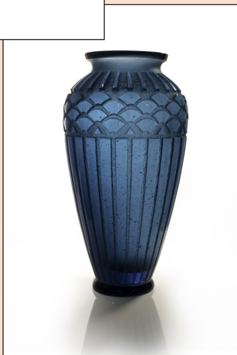
DAUM FRANCE Large vase Collection Rythmes In press moulded pâte de verre, tinted duck blue Estimate: 2 000 - 3 000 €