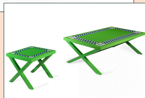
LIVING ROOM FURNITURE Composed of a coffee table and a piece of sofa Estimate: 800 - 1 000 €