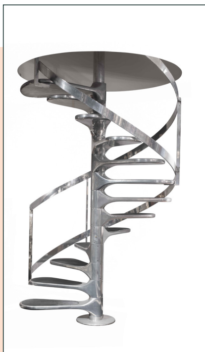
ROGER TALLON Spiral staircase, Model M400 1962 - In polished aluminium Estimate: 5 000 - 8 000 €