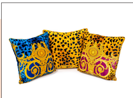
SET OF THREE CUSHIONS Atelier Versace fabric Estimate: 300 - 400 €