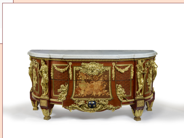
LOUIS XVI-STYLE CHEST OF DRAWERS After the model by Jean Henri Riesener for the bedroom of Louis XVI at the Château de Versailles. Estimate: 15 000 - 20 000 €